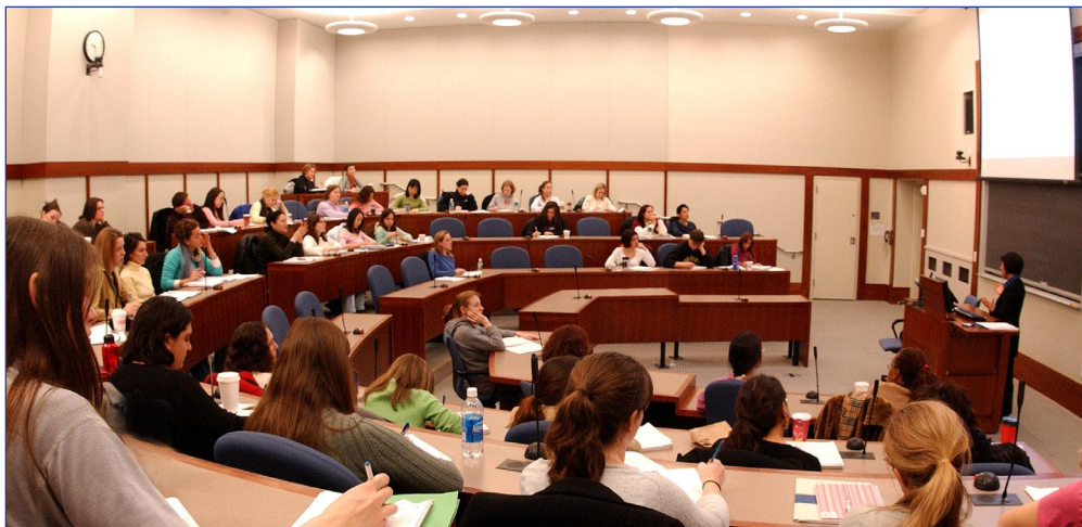
A classroom at Columbia University.