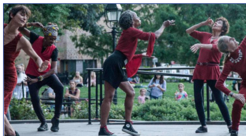
Outdoor dance class with LiLY.

Dances for a Variable Population is a movement-centered community that provides outdoor dance classes for seniors at locations around the city.