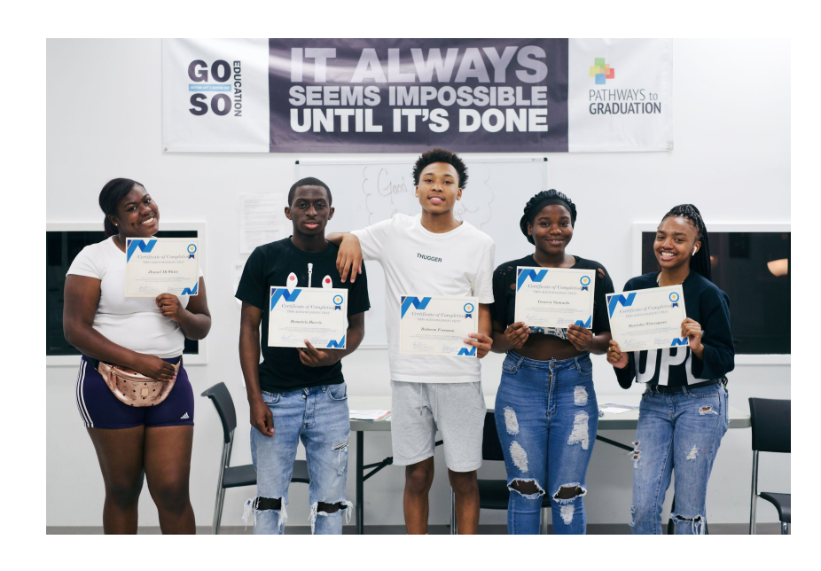
Members of Stand Against Violence East Harlem's internship program upon completion of a Connecting Youth Initiative workshop series