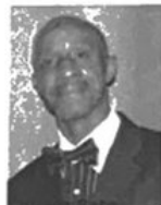
National Action Network Second Chance Committee