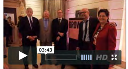
Brown Institute for Media Innovation Grand Opening