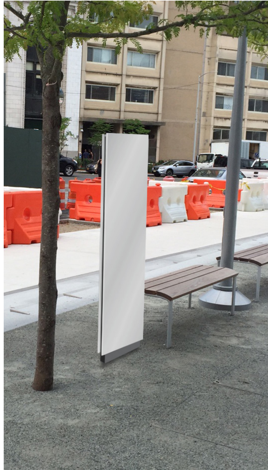
Side B facing square: Day 1