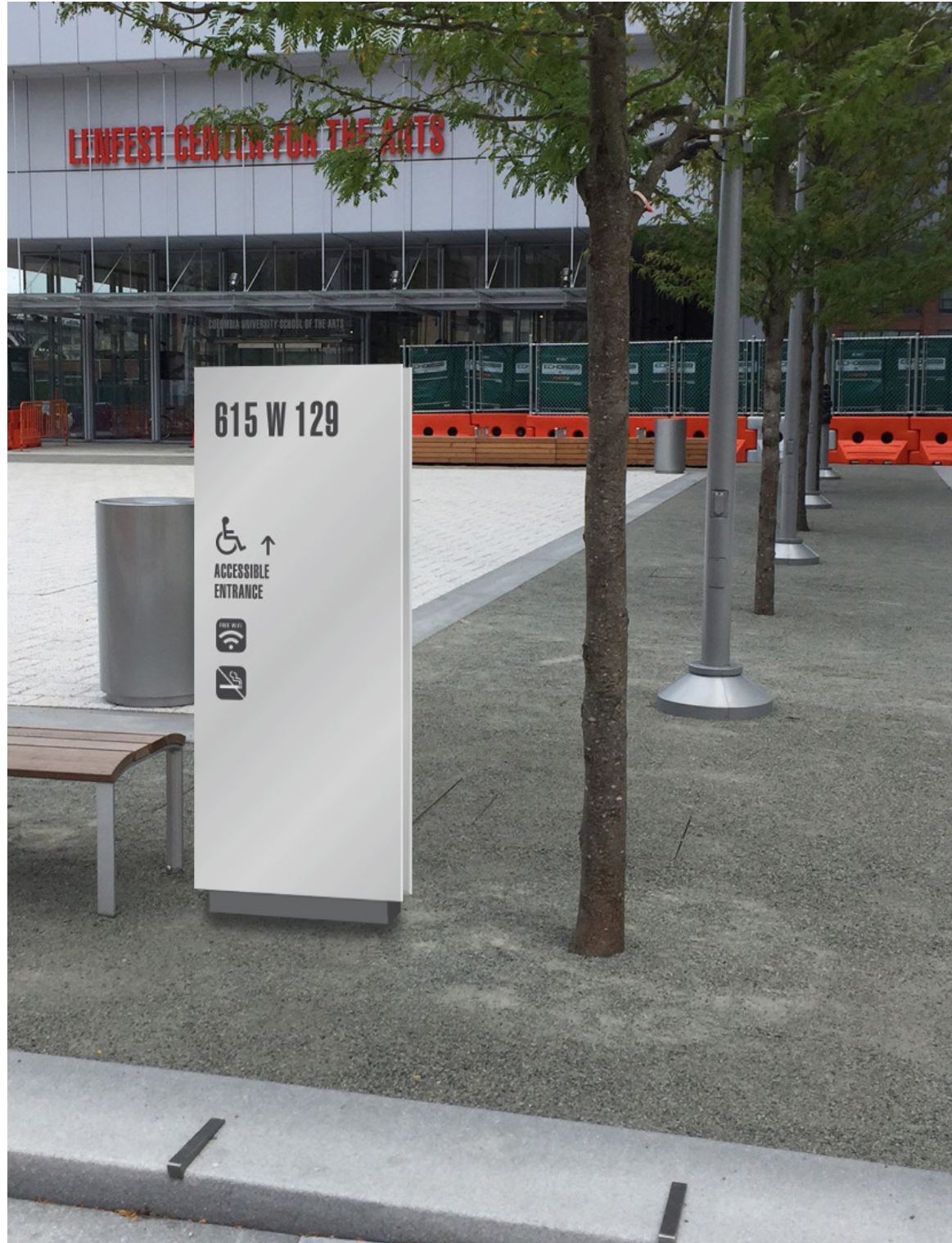
Side A facing street