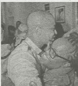
T.I. shares a moment with a life long fan

Hip Hop recording artist T.I. touched down in Harlem on September 19th for a book signing of his latest book entitled "Trouble & Triumph: A Novel of Power & Beauty." The signing was coordinated by Hue-Man Bookstore as part of their pop up series and held at Chocolat Restaurant, located at 2217 Frederick Douglass Boulevard.