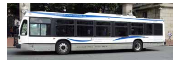
Columbia University provides free shuttle service on most weekdays.

Also in September 2013, Columbia University expanded its Lifelong Learners Program to include up to 50 members of the local community, with 25 of those members coming from Manhattanville and/or Grant Houses. The Lifelong Learners Program provides an opportunity for individuals over 65 and not currently enrolled in college to audit select lectures and courses drawn from the University's offerings in the Arts and Sciences during the academic year, at no charge. First launched in 1986 in partnership with the Brookdale Institute on Aging and Human Development, Columbia's School for Continuing Education runs the Lifelong Learners Program.