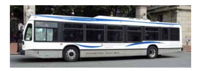
Columbia University provides free shuttle service on most weekdays.

Also in September 2013, Columbia University expanded its Lifelong Learners Program to include up to 50 members of the local community, with 25 of those members coming from Manhattanville and/or Grant Houses. The Lifelong Learners Program provides an opportunity for individuals over 65 and not currently enrolled in college to audit select lectures and courses drawn from the University's offerings in the Arts and Sciences during the academic year, at no charge. First launched in 1986 in partnership with the Brookdale Institute on Aging and Human Development, Columbia's School for Continuing Education runs the Lifelong Learners Program.