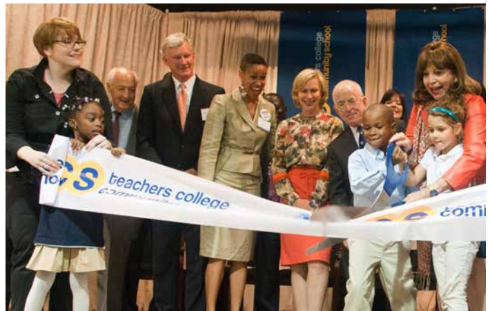
The Teachers College Community School opened in 2011 and when fully enrolled will serve approximately 300 children in pre-K through 8th grade.

For more information on Columbia Undergraduate Scholarships, contact the Office of Financial Aid & Educational Financing at 212-854-3711.