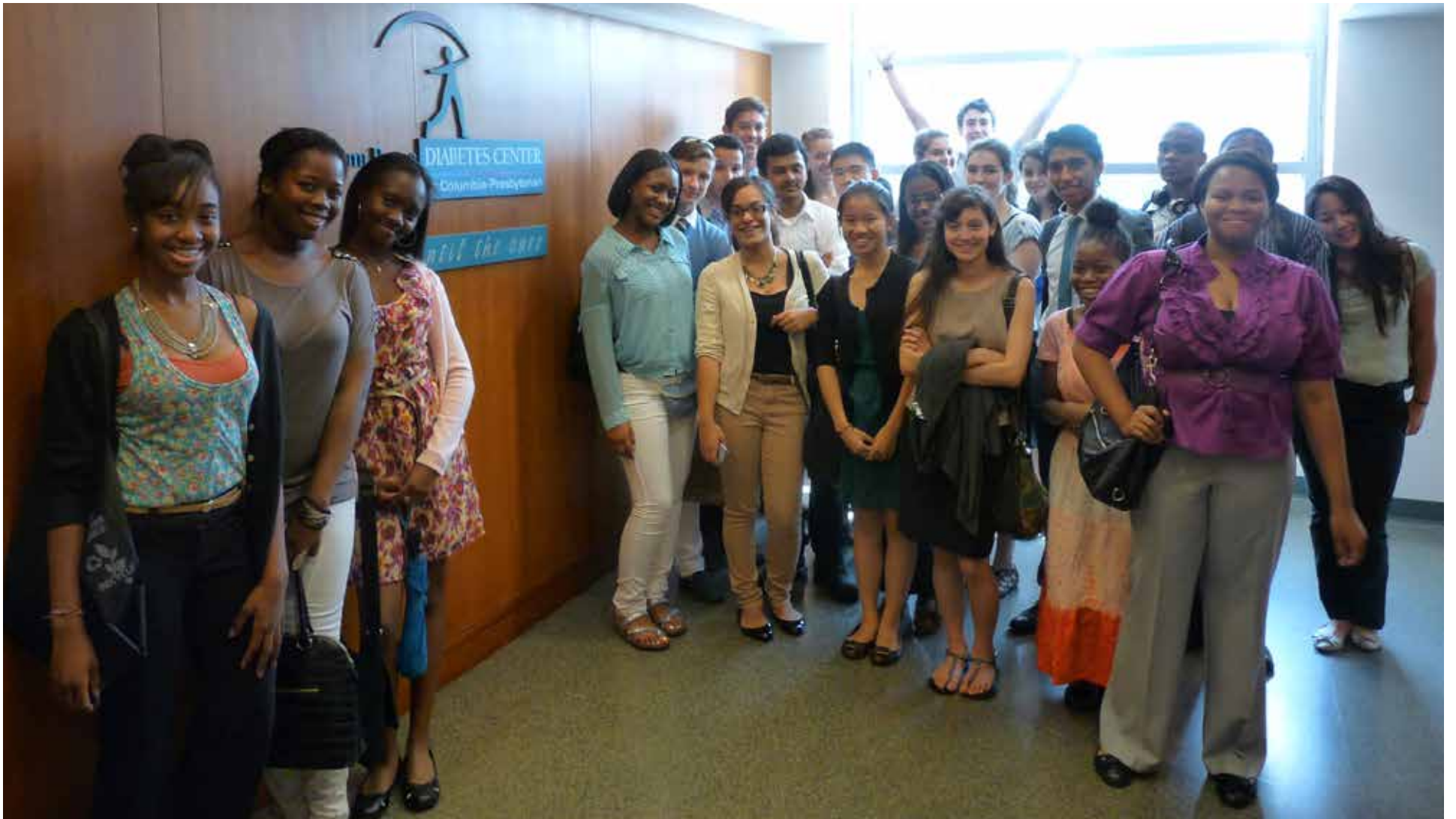
Recent participants in the Columbia University Local Community High School Summer Internship Program paid a visit to the Diabetes Center at Columbia University Medical Center/NewYork-Presbyterian Hospital.

Bringing young people to campus for summer internships and camps is part of a continuing effort to make the University's resources available to our neighbors. One such program provides scholarships for children in the Manhattanville/West Harlem area to attend Roaree's Cubs Camps, a sports program for children 6 through 12. Another program offers paid, five-week summer internships for high school students.