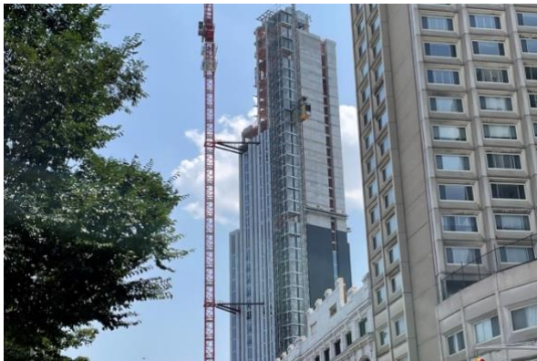
600 W. 125th Street, looking east