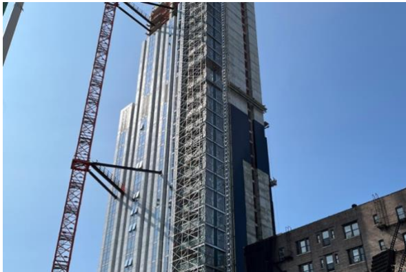
600 W. 125th Street, looking southeast