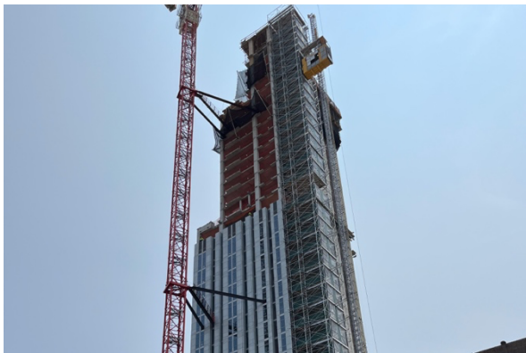
600 W. 125th Street, looking southeast