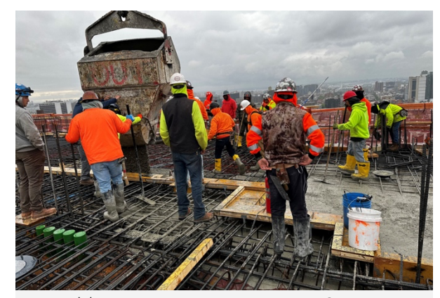
The 29th floor of 600 W. 125th Street