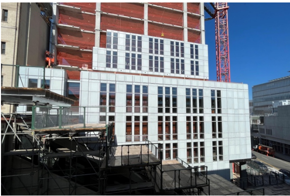
600 W. 125th Street, looking west