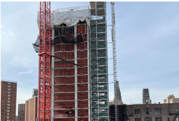
600 W. 125th Street, looking south