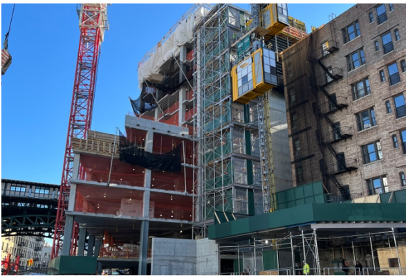
600 W. 125th Street, looking east