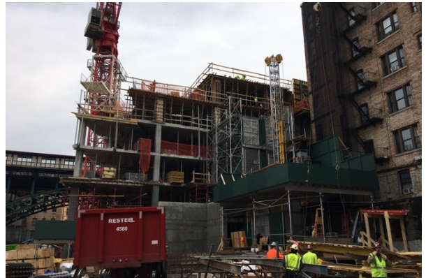
600 W. 125th Street, looking east