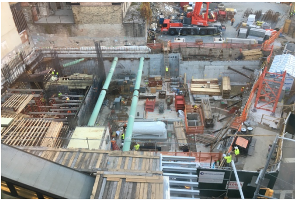
600 W. 125th Street, looking west