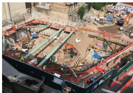
600 W. 125th Street, looking west