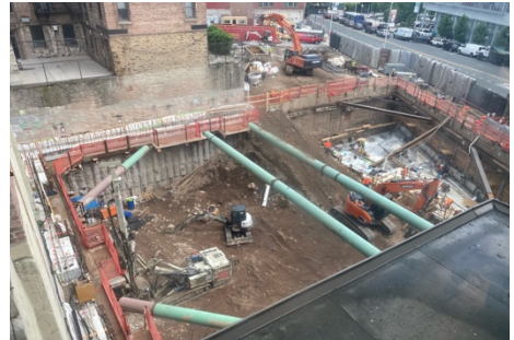
600 W. 125th Street, looking west