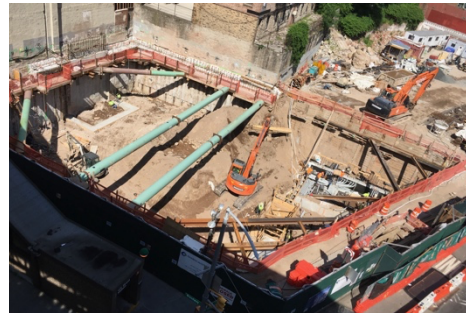
600 W. 125th Street, looking west