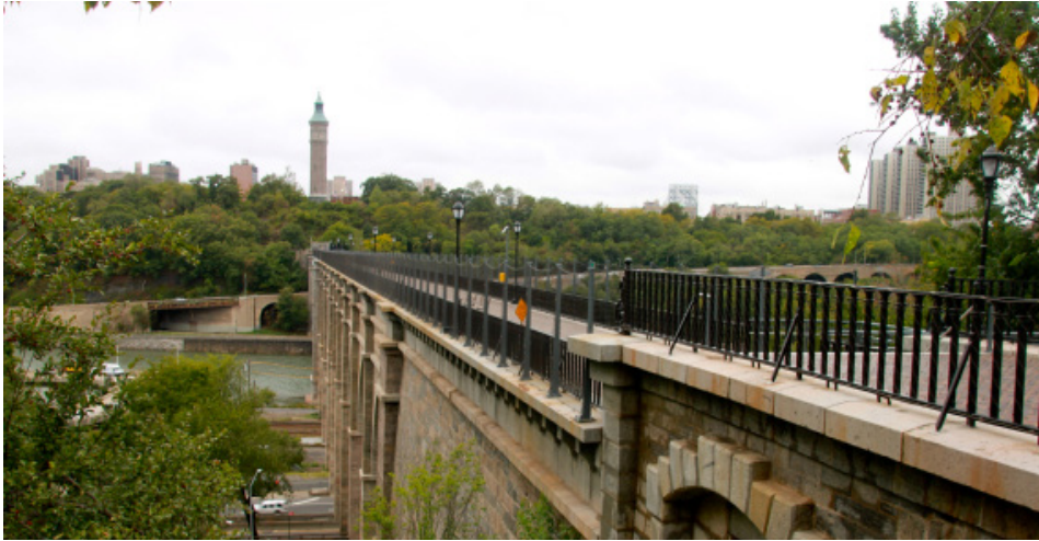
The High Bridge connecting Washington Heights with the Bronx.