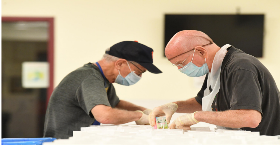
CCS Grantee: Broadway Community