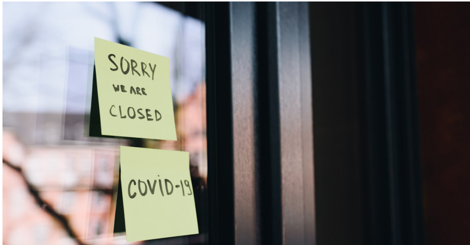
Pictured: Business Closed