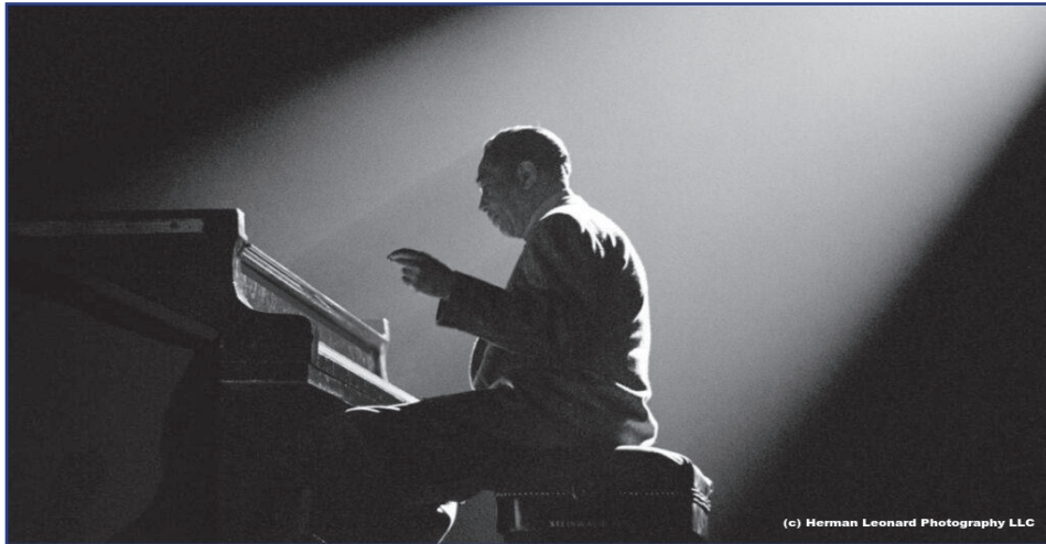
Duke Ellington.