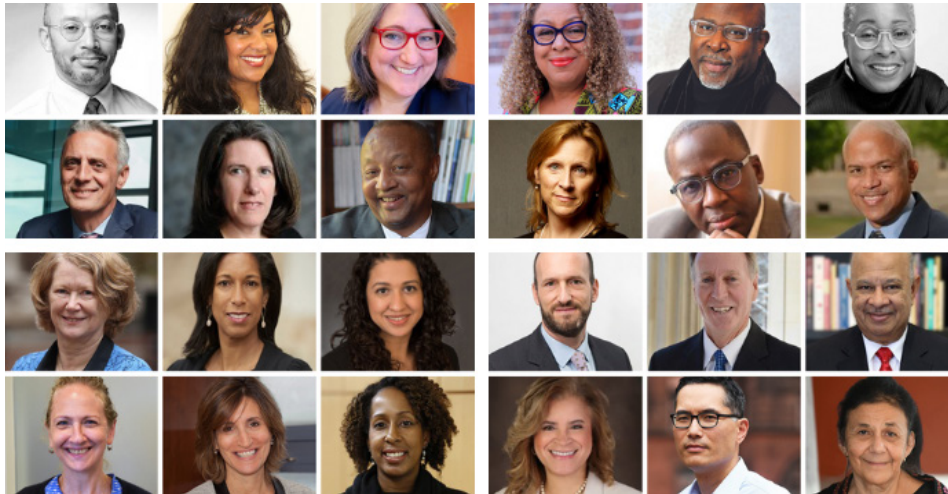
The members of the Community Advisory Council.