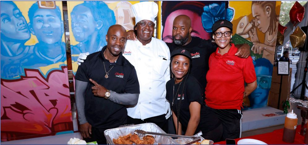
Taste of Harlem 2023.