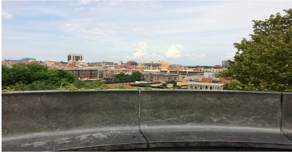
The view of Harlem from the Carl Shurz Memorial overlook.