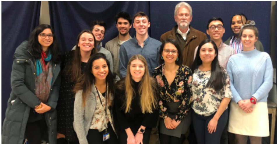
Pictured: CHHMP Staff