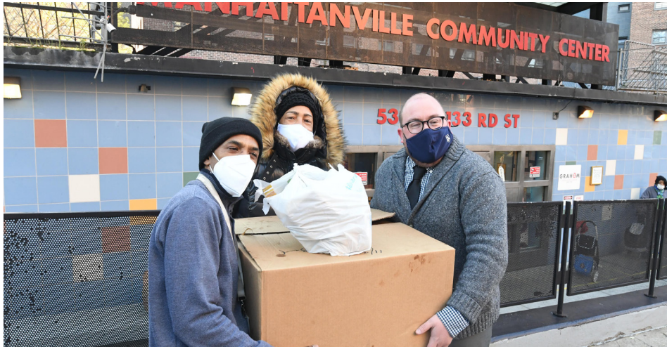
CUFO employees delivering meals to seniors at Manhattanville Community Center.