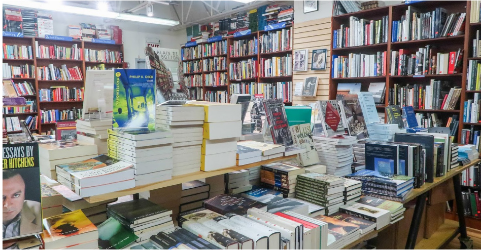
Inside Book Culture's W. 112th Street store.