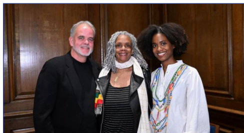
Bundles Scholars at a welcome reception.

The Bundles Scholar program gives Uptown community members a three-year affiliation with Columbia and access to campus resources to work on a project or skill of their choosing. New this year, the Bundles Scholars program will be partnering with the university’s Incite Institute to offer scholars several new opportunities and enhancements, including greater funding, mentorship, skill-