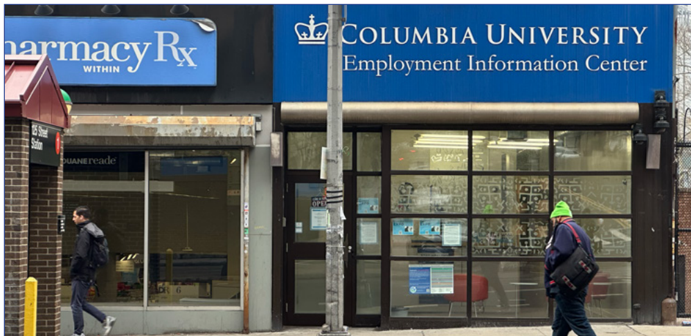
The Columbia University Employment Information Center.