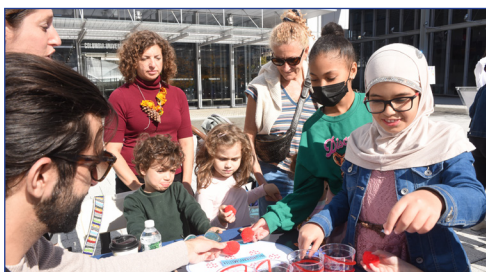
Manhattanville Community Day.

We invite our neighbors surrounding Columbia's campuses in Morningside Heights, West Harlem, Harlem, and Washington Heights as well as