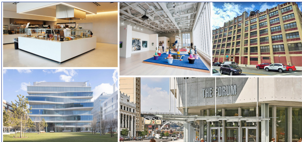
From top left to bottom right: The Café at David Geffen Hall, Wallach Art Gallery, Nash Building, The Square, and The Forum.