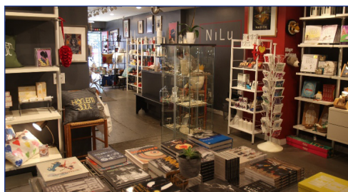
NiLu Gift Boutique.

Step into NiLu Gift Boutique in Harlem for candles, books, art prints, trinkets, decor, and more. Find your literary friend’s next read at Word Up Community Bookstore or Sisters Uptown Bookstore in Washington Heights. For the fashionista in your life, gift an incredible vintage find from Trintage in Harlem. If you’re a guest for Christmas dinner, bring a bottle of wine from Vino Fino or sweets from Mondel Chocolates in Morningside Heights.