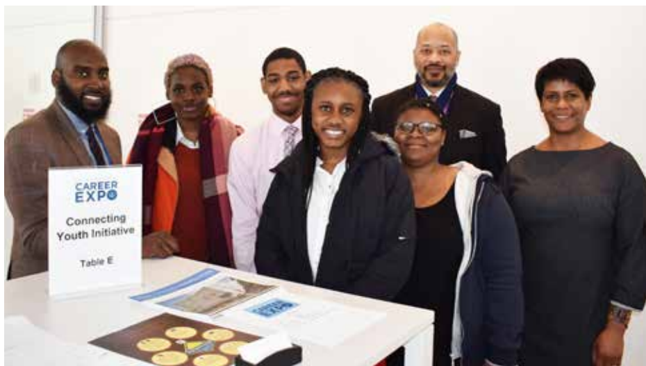
CYI staff with youth and staff from the Isaacs Center, a CYI partner organization that refers job-ready candidates with hopes of securing positions at Columbia to CYI