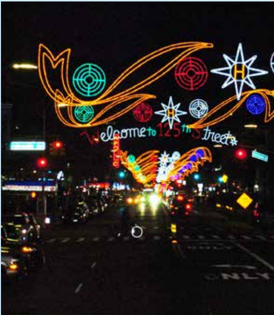
Harlem Holiday Lights Celebration

With increased activity taking place on the Manhattanville campus and streetscape improvement work nearing completion, Columbia University sought a partner that would support maintenance services along 125th Street. The Harlem 125th Business Improvement District (BID) was officially awarded the contract in late spring to maintain the perimeter of the Manhattanville campus. The contract will go into effect once the corridor has officially been placed under Columbia’s jurisdiction.