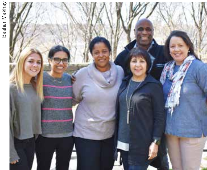
Members of SBDC staff and advisers